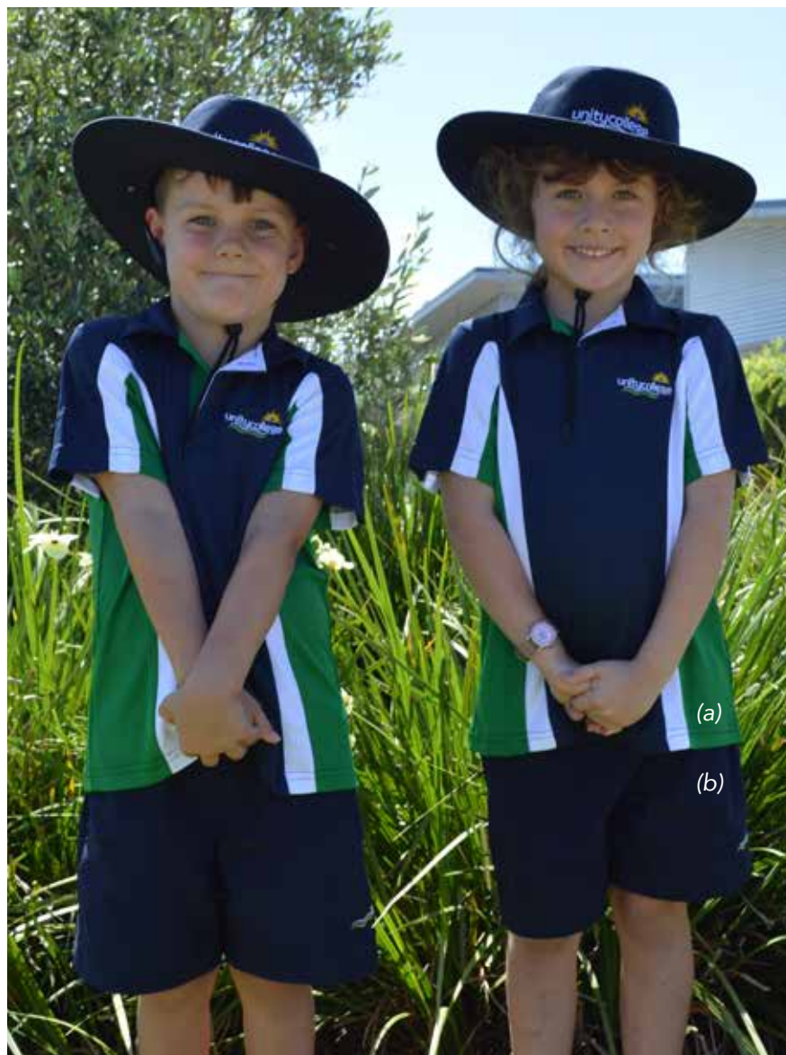
Formal Uniform: Prep