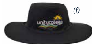
Formal Uniform: Years 1 to 6