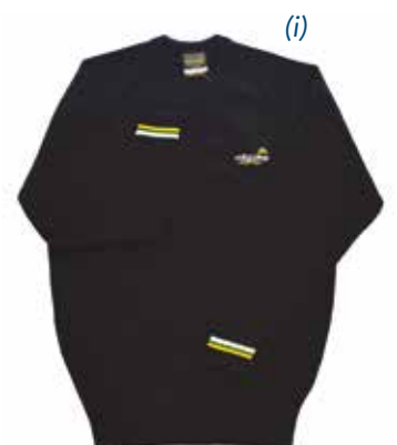
Formal Uniform: Middle Phase