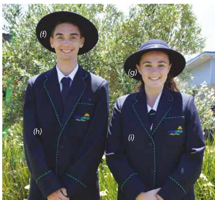
Formal Winter Uniform: Senior Phase