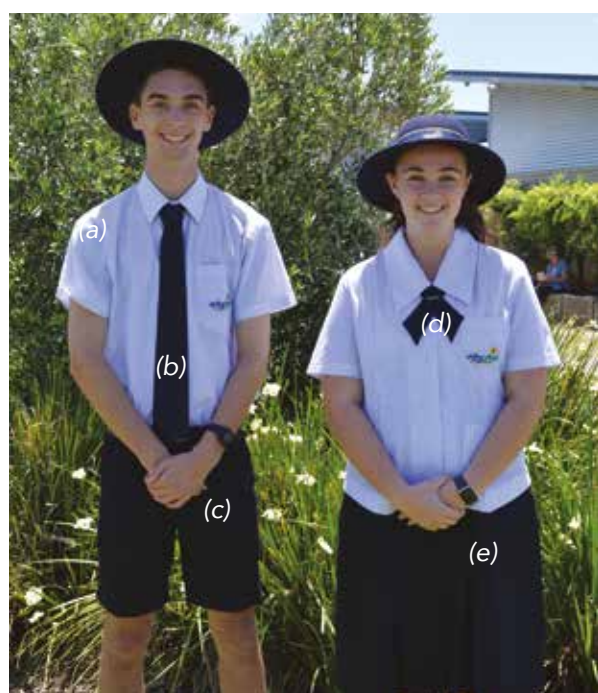
Formal Summer Uniform: Senior Phase